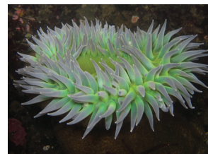
Giant green anemone

Watch for the slow-moving sea stars as they envelop their prey. Look for small camouflaged fish called sculpins; they typically hide in the pools and dart about quickly.