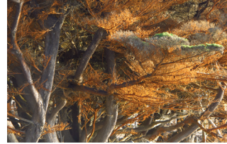
Algae on cypress

You are now walking in a Monterey Cypress forest. These trees were planted here more than a century ago. As you walk through the forest, you may notice something orange on the limbs of some trees. This is a type of green algae in the genus Trentepohlia . This species of algae is rich in carotene, which is the same pigment that makes carrots orange.