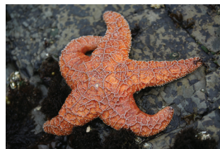
Ochre sea star