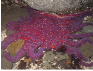
Giant sunflower star