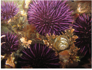
Purple sea urchin